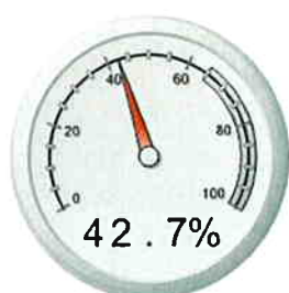
Hours of Service