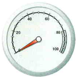
Drug & Alcohol